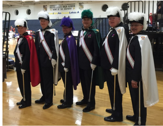
Assembly 2185 Attend opening ceremony of Special Olympics at Lake Taylor High School in Virginia Beach